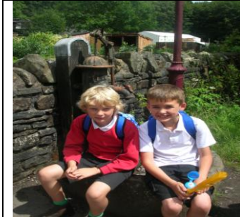
The whole school trip to the Welsh Folk Museum

Visits for pupils outside of school over the last few terms have included class 2 visit to the Roman museum at Caerleon and class 3 visit to Bristol Mosque and London.