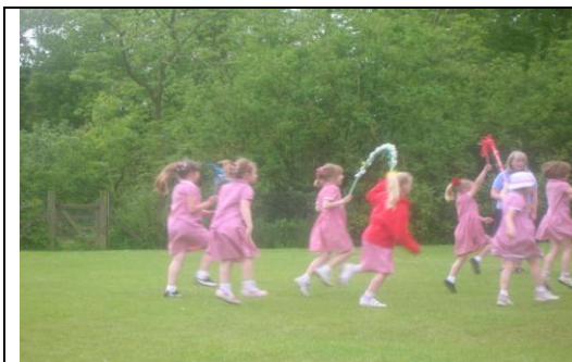
Class 2 country dancing at Tortworth school

Iron Acton is proud of its small village school status. It belongs to an active cluster group with 9 other small schools in the local area which provides support, an opportunity to share interest and expertise. The schools work on joint projects such as Mummer's plays, sculpture days, dance workshops, orienteering and a Maths trail.