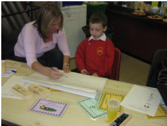
A Domino afternoon organised by PALS

This is a group run by parents for parents. They meet regularly to discuss school issues. They also organise curriculum evenings, talks by teachers and outside speakers. They produce a booklet full of practical information and run a lending library full of educational games and equipment for parents to borrow.