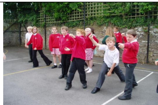
Year 5 taking part in an orienteering day at Iron Acton

Year 6 pupils have the opportunity to attend an annual residential visit to a PGL camp with pupils from North Road and Rangeworthy.